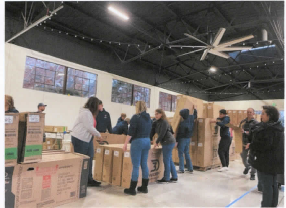
With help of Young Men's Service League volunteers, all was ready on Friday night for the builders to assemble bikes on Saturday.