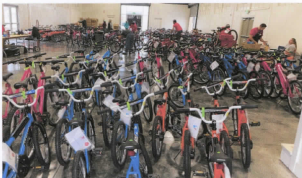
After passing through Quality Control bikes are staged to be picked up by charities later in the day