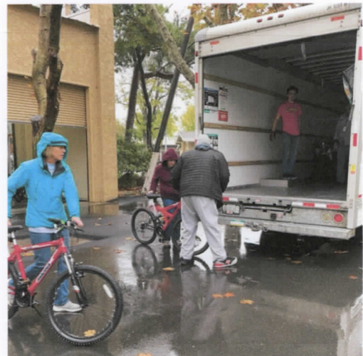
Charities arrived with pickups, trailers, box trucks and rental trucks, to pick up their bike allotments.