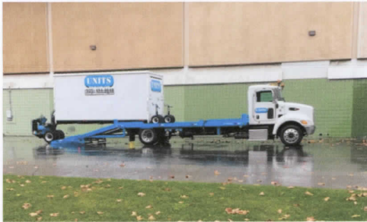
UNITS portable storage in Livermore transported a donated container of KBL supplies to the Fairgrounds and another container to deliver bikes to a charity.