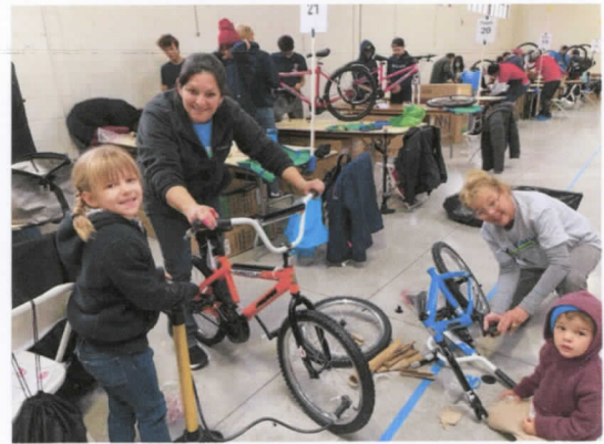
Volunteers of all ages worked in small groups of friends, families, or social bubbles to assemble the bikes.