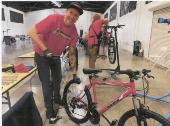
Quality Control mechanics checked to be sure every bike was safe to ride before they were picked up by the charities.