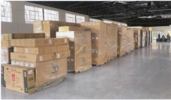
553 bikes were delivered in boxes on pallets and stacked in building Q at the Alameda County Fairgrounds in Pleasanton where bikes would be assembled on Saturday, December 3.